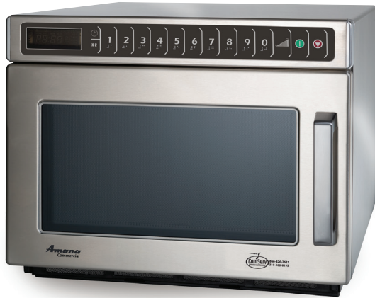
Model HDC182 shown