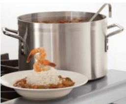
Large 5" (127 mm) stainless steel landing ledge for convenient plating.