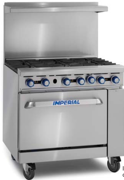
IR-6 shown with optional casters

OPEN BURNERS - PyroCentric™ 32,000 BTU (9 KW) anti-clogging burner with a 7,000 BTU/hr. (2 KW) low simmer feature. Cast iron PyroCentric burners are standard on all IR Series Ranges.