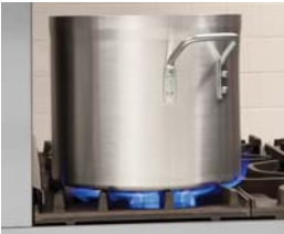
Back grate hot air dam deflects heat onto the stock pot, not the backsplash.