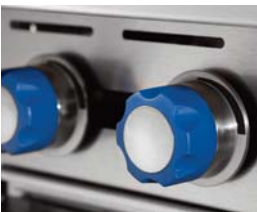
Durable cast aluminum with a vylox heat protection grip.