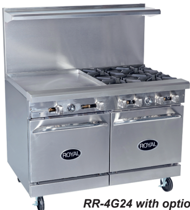
RR-4G24 with optional casters