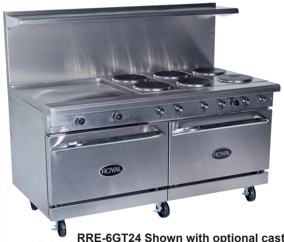
RRE-6GT24 Shown with optional casters