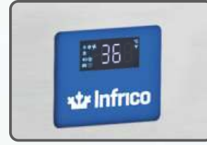
Protected digital controller