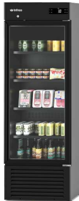
IMD-ERC 50 PH