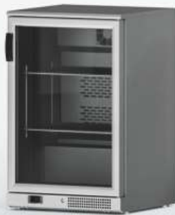
ERV15 II GD