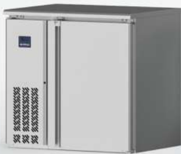
ERV36 II SD