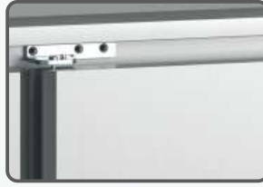
Removable top to fit 34" counter height