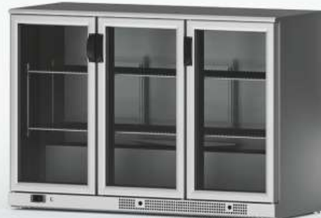
ERV35 II GD