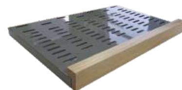
Wine Shelves (optional)