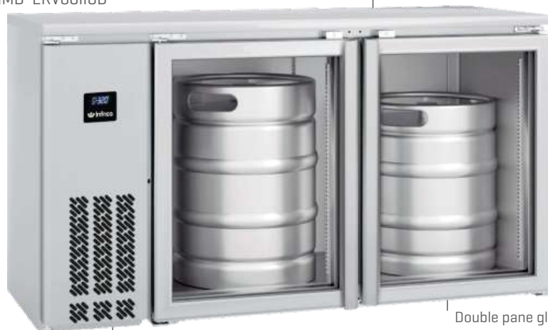
Standard door lock