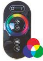
RGB LED lighting [standard]