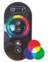
RGB LED lighting [standard]