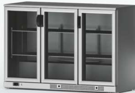
ERV35 II GD