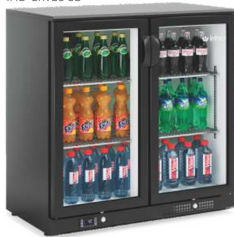
IMD-ERV25 C (Sliding Doors) IMD-ERV25 GD