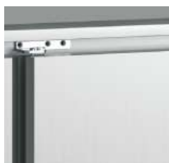
Removable top to fit 34" counter height