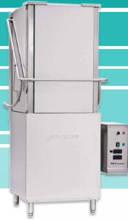
IDEAL FOR RETAIL & IN-STORE BAKERIES, DELIS, C-STORES, SCHOOL AND PIZZERIAS