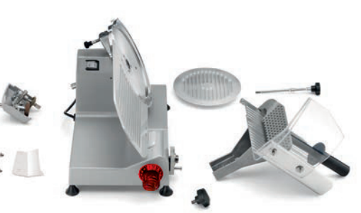
Easy and fast breakdown for cleaning