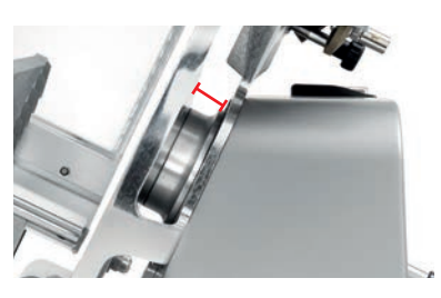
Wide gap between blade and body

Warranty: 1 year parts and labor warranty