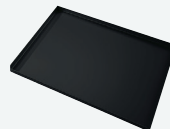
PT50 TEFLON TRAY