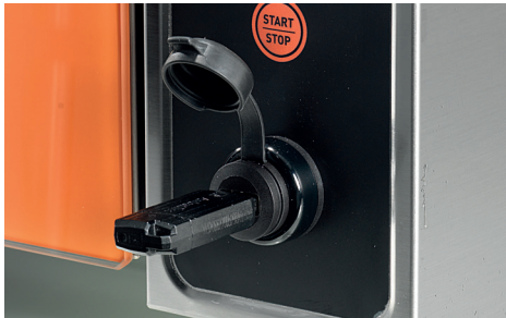
USB port to download and share up to 99 recipes.