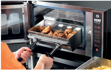
Ergonomic handles to remove the basket.