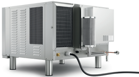
Condensation system and carbon filter (AIR / AIR.P / AIR PRO / AIR PRO.P)