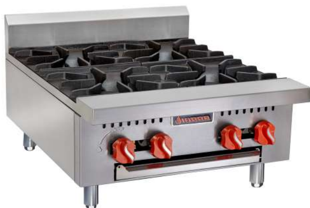
MODEL SRHP-4-24 (Pictured above)