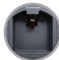
Standard easy push chute