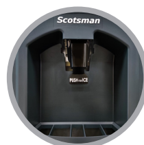
Optional sanitary lever dispensing kit available (KHDSANLV)