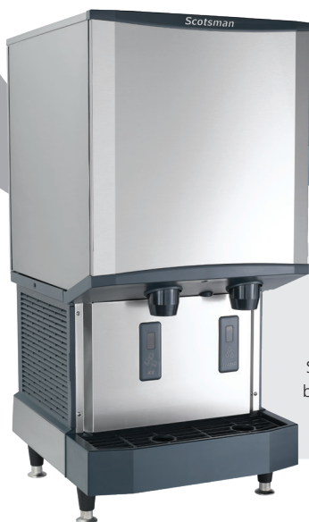
HID540A-1 with optional KLP24A legs

Sealed, maintenance-free bearings ensure maximum reliability and contribute to a long machine life