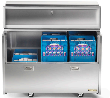
Model Shown - RMC49D4