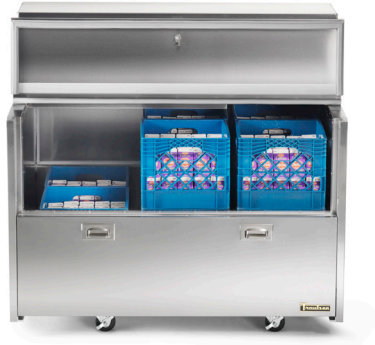
Model Shown - RMC49D4