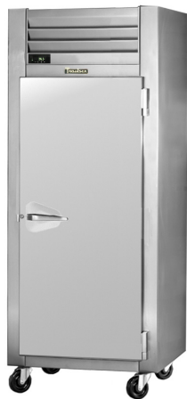
Model Shown One Section (shown with optional casters)