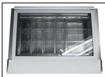
Glass Lid Top