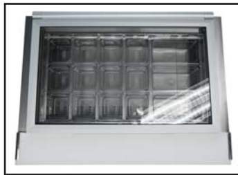
Glass Lid Top