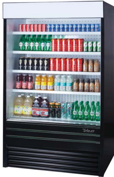
*Image shown here TOM-48EB-N