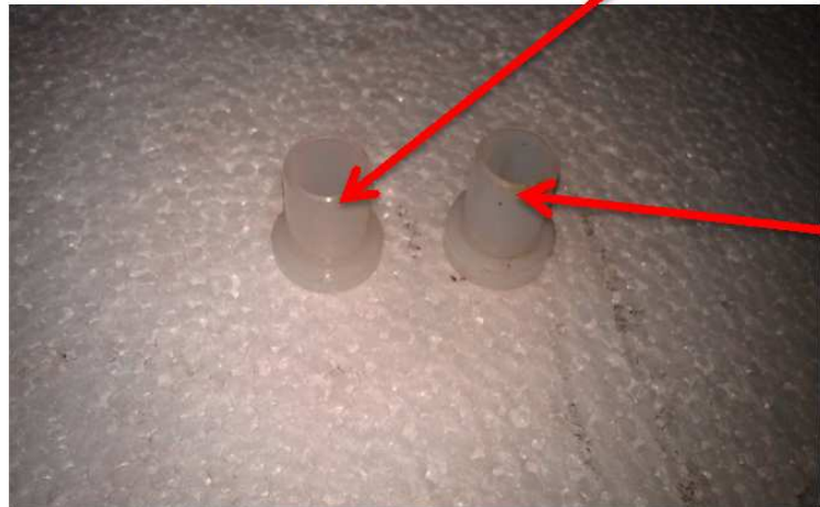
5 mm DOOR BUSHING