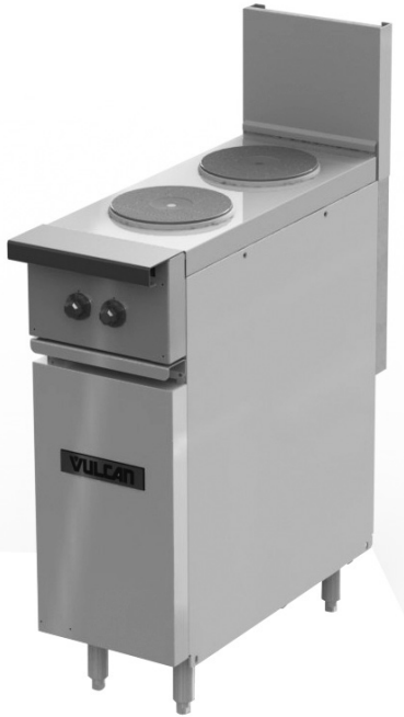
Model EV12-2FP208 shown with adjustable legs