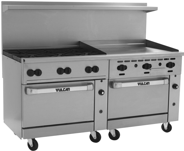
Model 72SS-6B36GN (shown with optional casters)