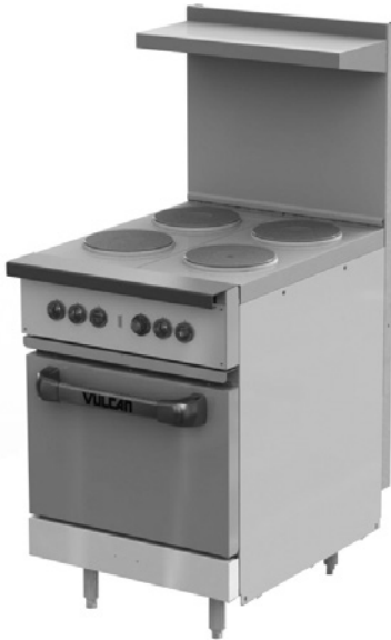
Model EV24S-4FP208 shown with adjustable legs