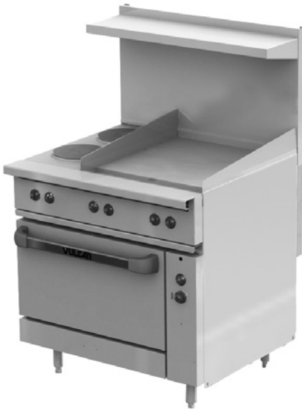
Model EV36S-2FP24G208 shown with adjustable legs