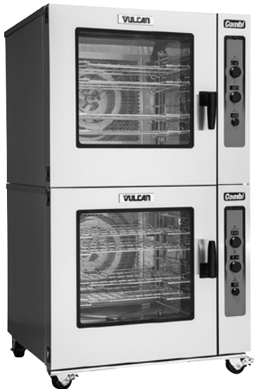
Model ABC7E (shown stacked)