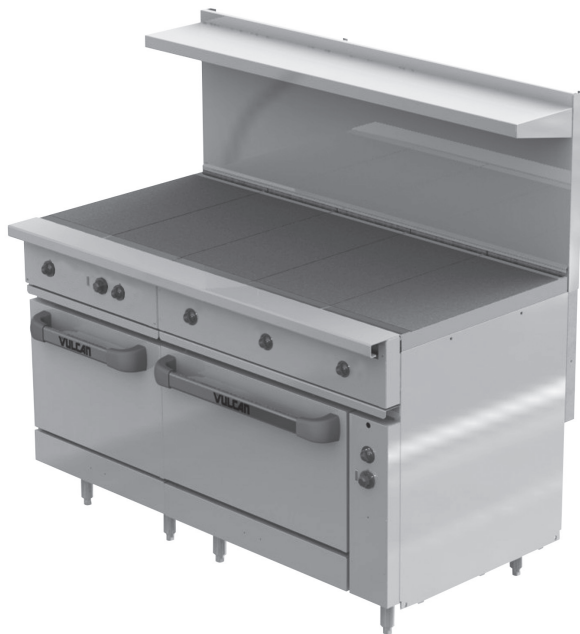
Model EV60SS-5HT208 Shown with adjustable legs