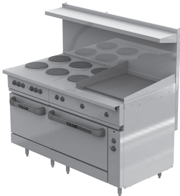
Model EV60SS-6FP24G208 Shown with adjustable legs