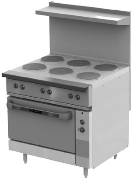
Model EV36S-6FP208 shown with adjustable legs