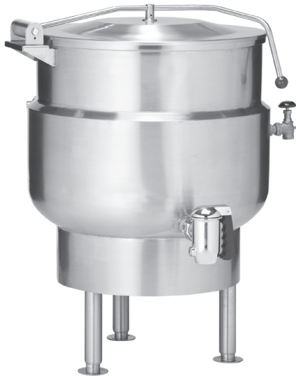
Model K20DL shown with optional 2" plug valve