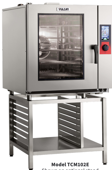
Model TCM102E Shown on optional stand