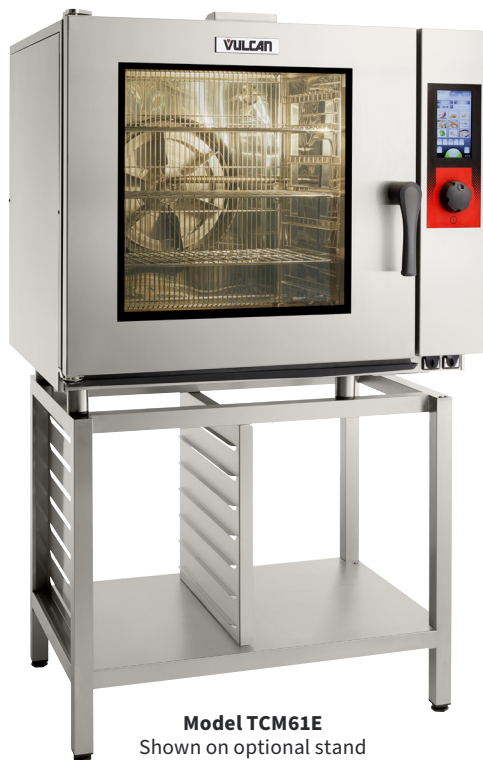
Model TCM61E Shown on optional stand