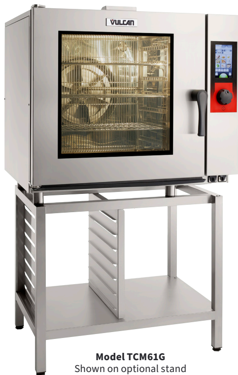
Model TCM61G Shown on optional stand