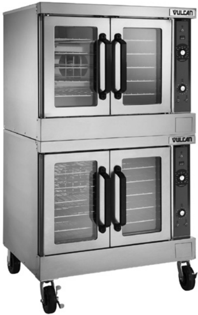
Model VC44ED Shown with optional casters