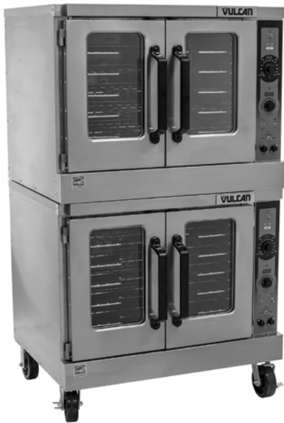
Model VC55ED Shown with optional casters