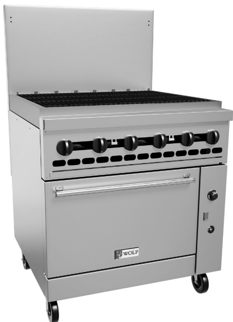
Model C36S-36CBN (shown on optional casters)