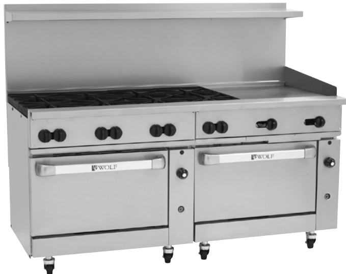
Model C72SS-8B-24G-N (shown with optional casters)